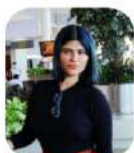
Pragati Fraud & Prevention

He is polite, hard-working, and a dedicated resource who always discharges his duties in a timely manner. He is ready to go the extra mile which has made him a valuable asset to the company. His colleagues always admire him for his approachability and positive attitude.