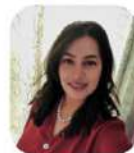
Mini Saha Content & Post

Pragati has done exceedingly well in handling business validation cases and ensuring that accurate information is being shared with the business to avoid unnecessary follow-ups. She always stands tall in arranging team bonding activities.